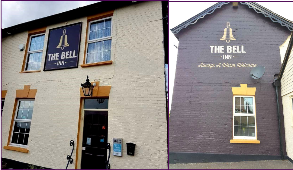
Above: The stylish new look. Below: last year and over 100 years ago