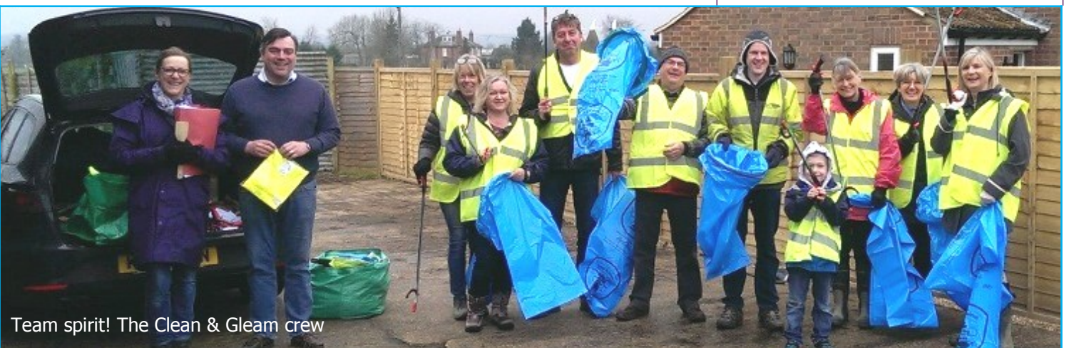
Team spirit! The Clean & Gleam crew