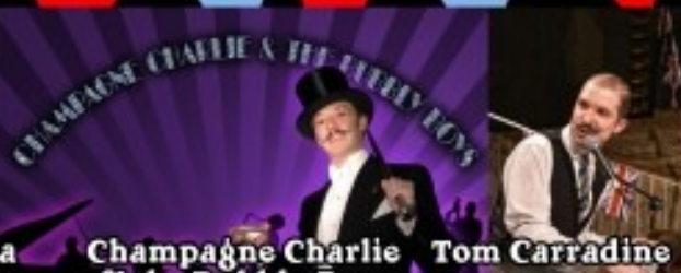
Champagne Charlie & the Bubbly Boys