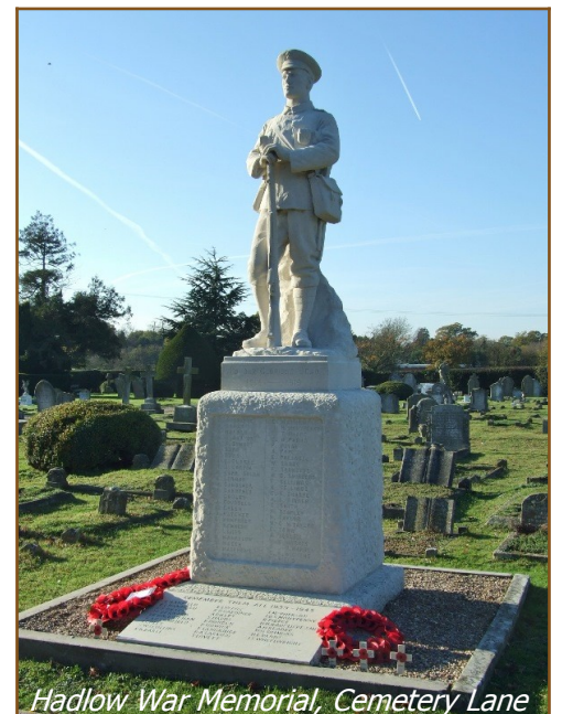
Hadlow War Memorial, Cemetery Lane