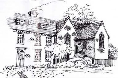
At Old Soar Manor (National Trust) the mediaeval knight's house is open to the public. Its elevated position beneath Mereworth Woods commands the river valley.