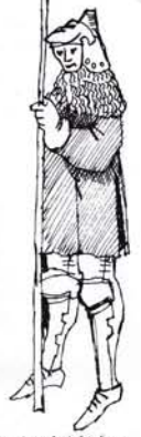
A 13th century knight, from a contemporary painting.