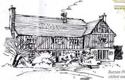
Barnes Place, listed Grade 1, is the oldest surviving house in Hadlow parish.