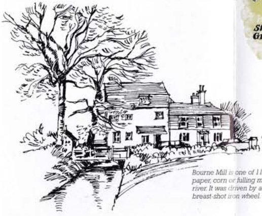
Bourne Mill is one of 11 known paper, corn or fulling mills on the river. It was driven by a 17 foot breast-shot iron wheel.