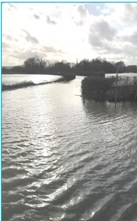
Hartlake Road on 18 February.